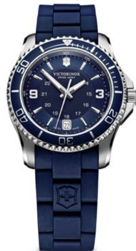
241610 - MAVERICK SMALL Ø 34 mm