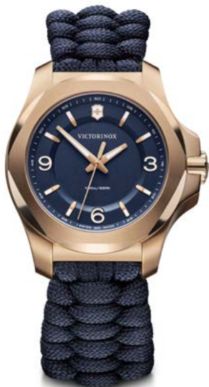
241955 * - I.N.O.X.V Ø 37 mm