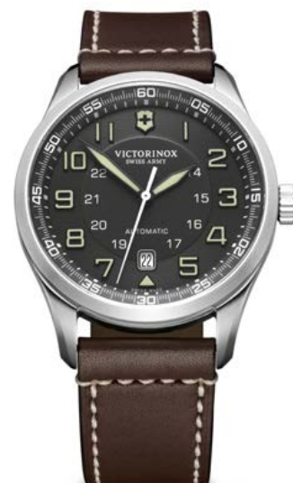
241507 - AIRBOSS MECHANICAL Ø 42 mm