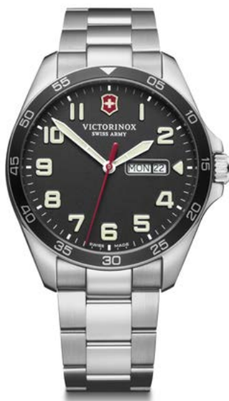
241849 - FIELDFORCE ø 42 mm