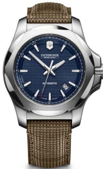
241834 - I.N.O.X. MECHANICAL Ø 43 mm