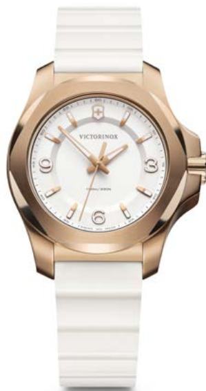
241954 * - I.N.O.X.V Ø 37 mm