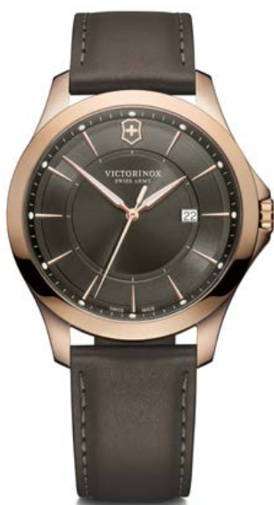
241908 ** - ALLIANCE Ø 40 mm