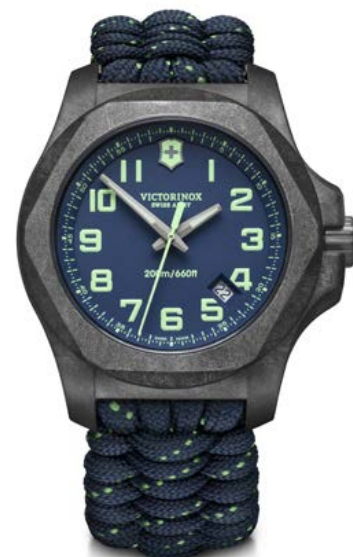
241860 - I.N.O.X CARBON Ø 43 mm