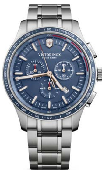
241817 - ALLIANCE SPORT CHRONO Ø 40 mm