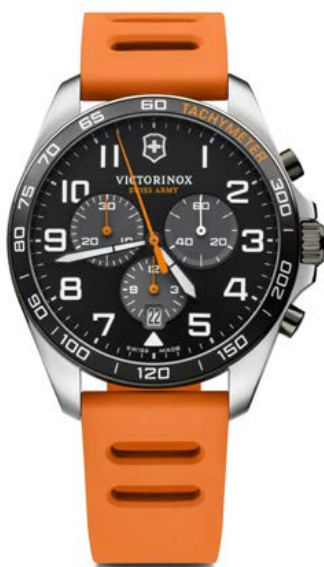
241893 1 - FIELDFORCE SPORT CHRONO Ø 42 mm