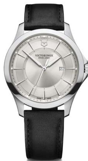
241905 1 - ALLIANCE Ø 40 mm