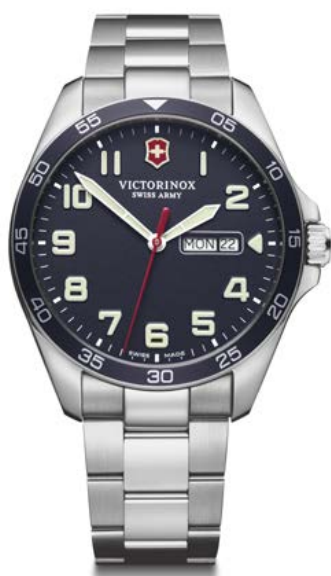
241851 - FIELDFORCE ø 42 mm