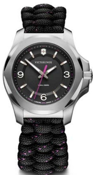
241918 - I.N.O.X.V Ø 37 mm