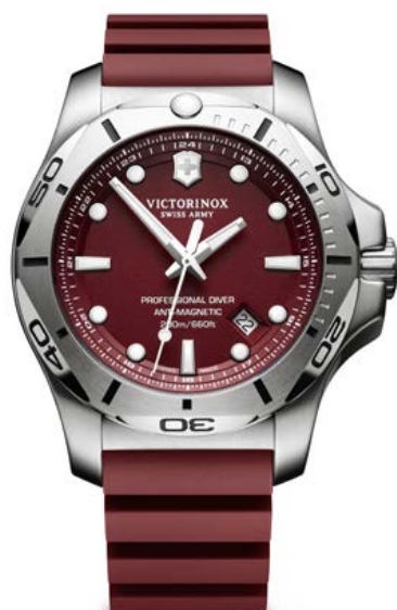
241736 - I.N.O.X PROFESSIONAL DIVER Ø 45 mm