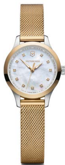
241879 */** - ALLIANCE XS Ø 28 mm