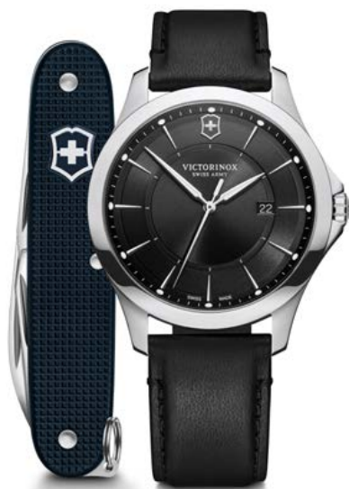
241904.1 * / 1 - ALLIANCE Ø 40 mm