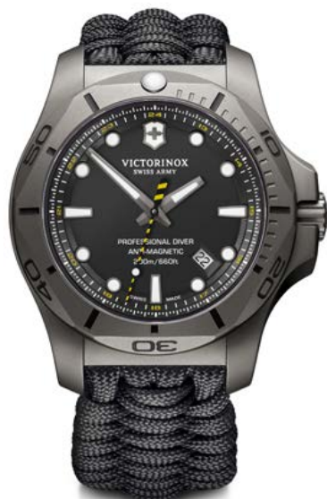
241812 - I.N.O.X PROFESSIONAL DIVER TITANIUM Ø 45 mm