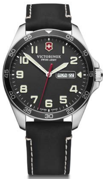
241846 - FIELDFORCE ø 42 mm