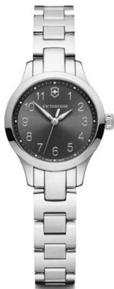
241839 - ALLIANCE XS Ø 28 mm