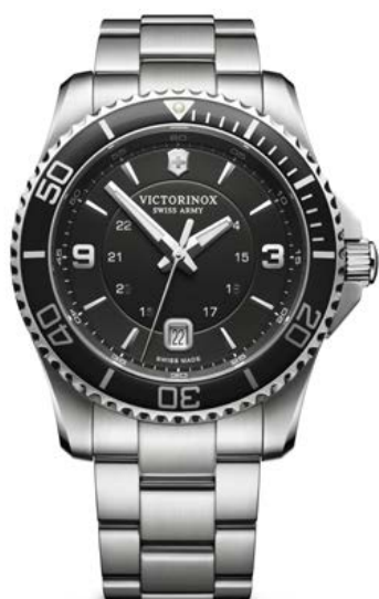
241697 - MAVERICK ø 43 mm