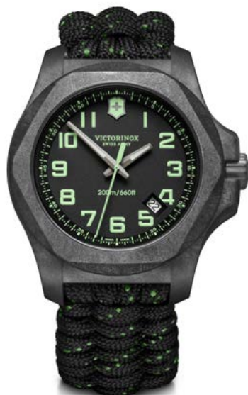
241859 - I.N.O.X CARBON Ø 43 mm