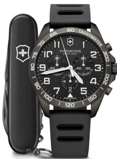
241926.1 */** - FIELDFORCE SPORT CHRONO Ø 42 mm