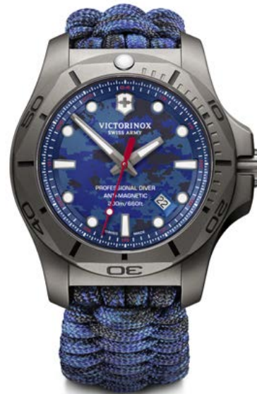
241813 - I.N.O.X PROFESSIONAL DIVER TITANIUM Ø 45 mm