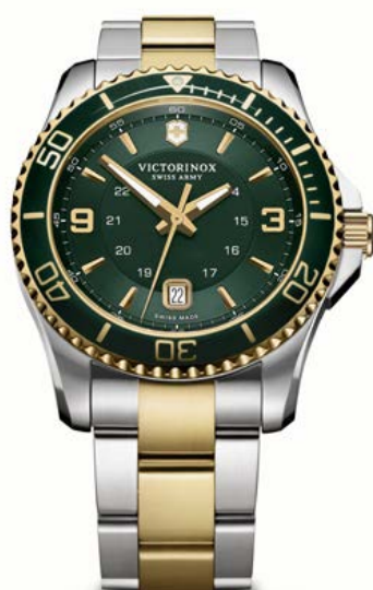
241605* - MAVERICK ø 43 mm