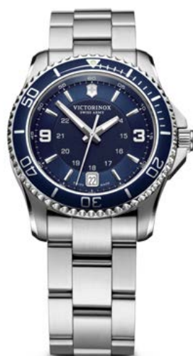
241609 - MAVERICK SMALL Ø 34 mm