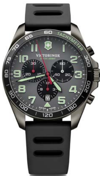
241891 * - FIELDFORCE SPORT CHRONO Ø 42 mm