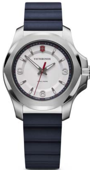
241919 - I.N.O.X.V ø 37 mm