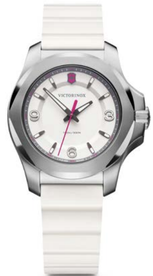
241921 - I.N.O.X.V ø 37 mm