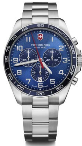
241901 - FIELDFORCE CLASSIC CHRONO Ø 42 mm