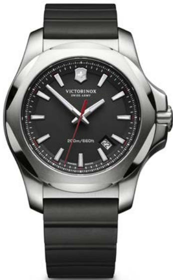
241682 - I.N.O.X. Ø 43 mm