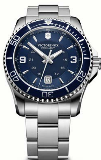
241602 - MAVERICK ø 43 mm