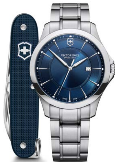
241910.1 * / 1 - ALLIANCE Ø 40 mm