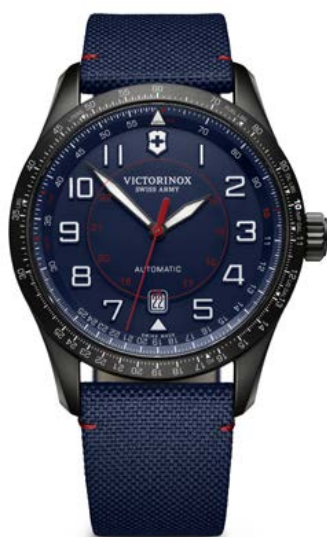
241820 * - AIRBOSS MECHANICAL Ø 42 mm