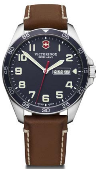
241848 - FIELDFORCE ø 42 mm