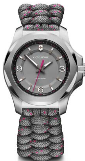
241920 - I.N.O.X.V Ø 37 mm