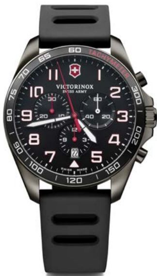
241889 * - FIELDFORCE SPORT CHRONO Ø 42 mm