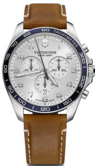
241900 - FIELDFORCE CLASSIC CHRONO Ø 42 mm