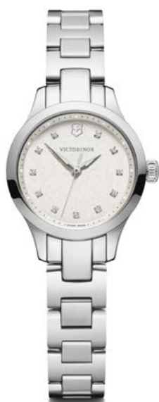
241875 ** - ALLIANCE XS Ø 28 mm