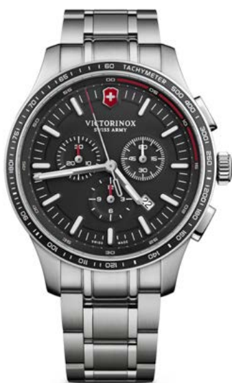
241816 - ALLIANCE SPORT CHRONO Ø 40 mm