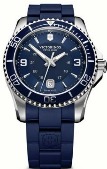
241603 - MAVERICK ø 43 mm