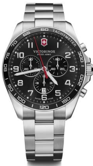
241899 - FIELDFORCE CLASSIC CHRONO Ø 42 mm