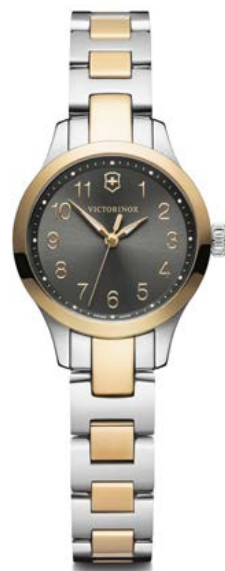
241841 * - ALLIANCE XS Ø 28 mm